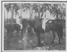
"Hi Yo Silver"