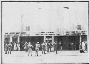
Nothing to do; how about a movie?