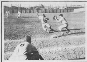
SLIDE FELLA, SLIDE