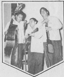
THREE JIVE ARTISTS