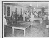
BIBLE CLASS --- REC. HALL