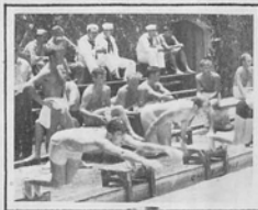
50 YD. FREE STYLE