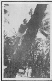
"Go climb a tree"