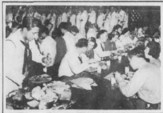
FIRST PARTY OVERSEAS