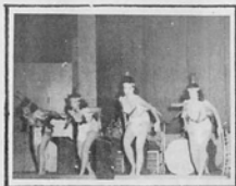
ON THE WARPATH