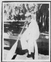
Dry land sailor