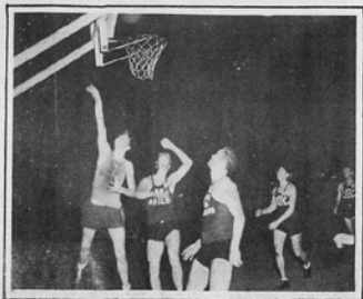
GET THAT REBOUND!!!