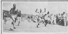
100 YD. DASH